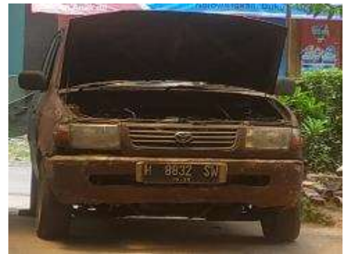
Kartini the Kijang